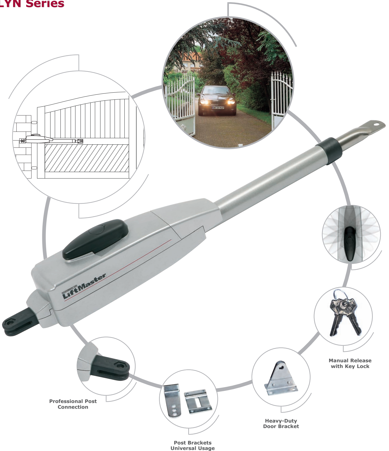
Professional Post Connection