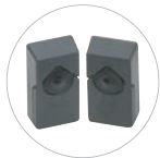
771E Infrared Safety Sensor