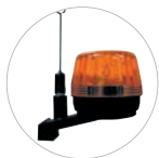
FLA230-2 Flashing light kit

For more accessories please refer to accessory catalog