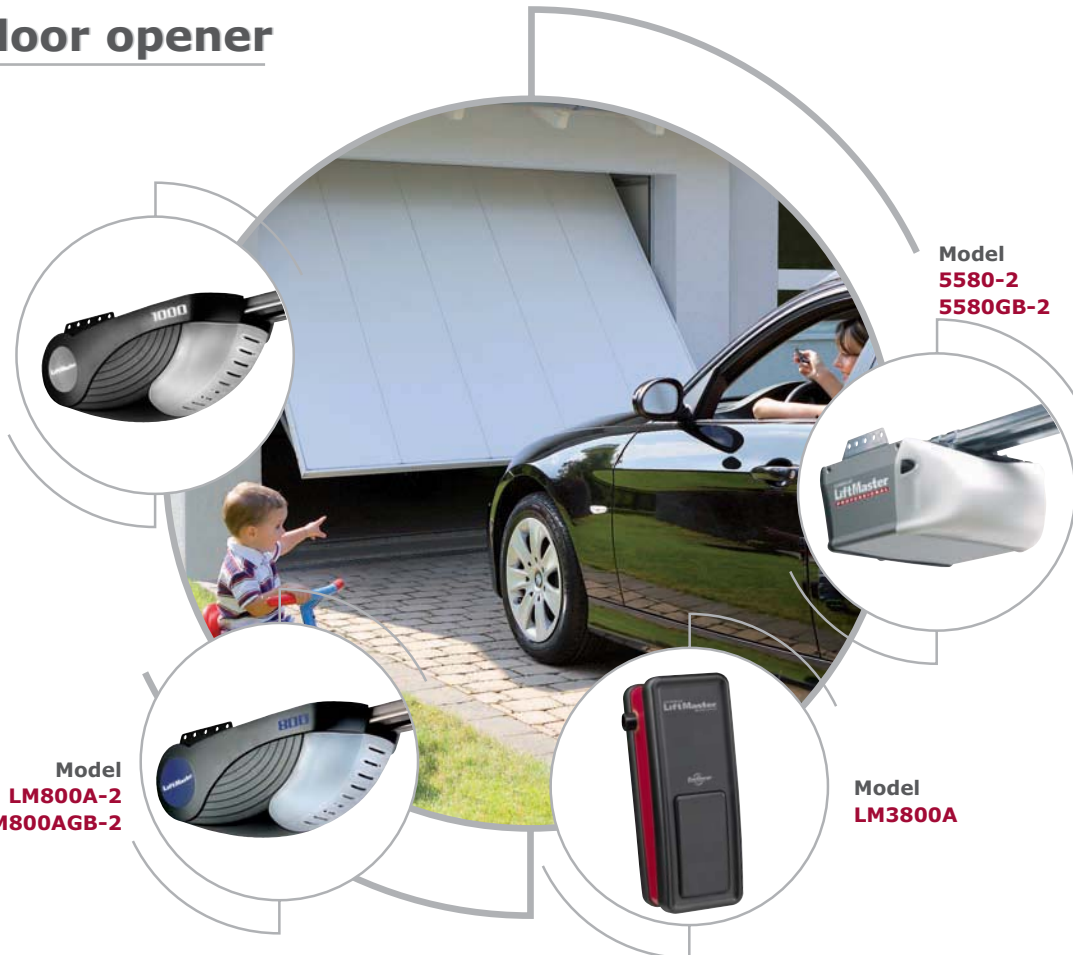
Model LM1000A-2 LM1000AGB-2