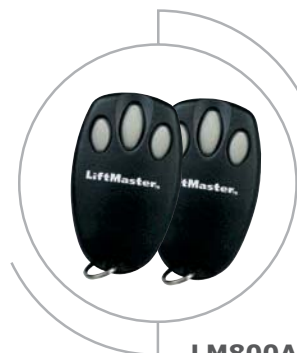
LM800A-2 5580-2 LM3800A RDO800